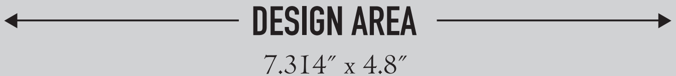
Image resolution MUST be 300 ppi or greater.

AD MATERIAL SUBMISSION: Send via email to mpads@cowboysindians.com .